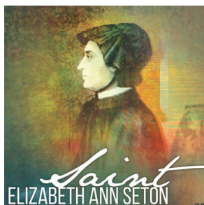
St. Elizabeth Ann Seton, patron saint of Catholic Schools, pray for us.